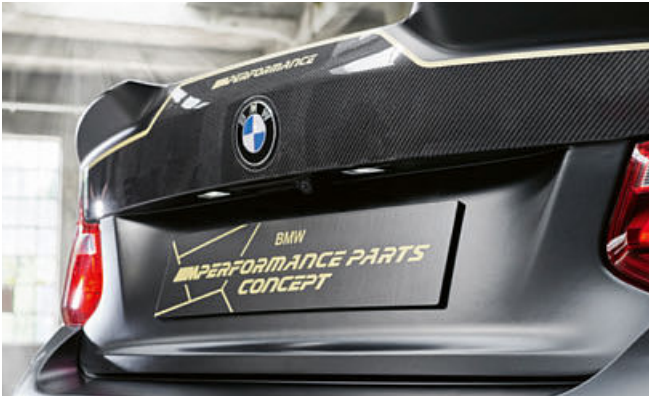
Many will only see it from behind: The carbon-fibre boot lid saves 5 kg in weight.